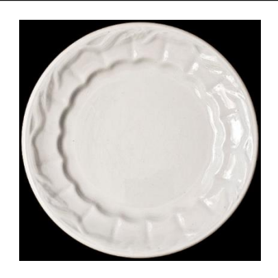
Wheat Breakfast Plate