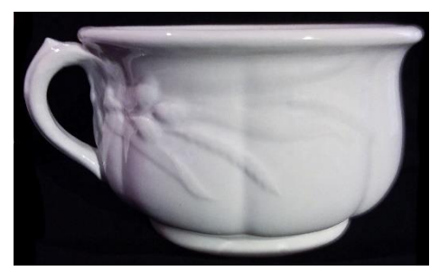
Wheat & Hops Chamber Pot