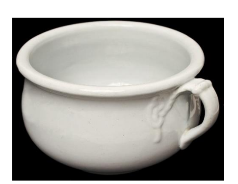
Cable & Ring Chamber Pot