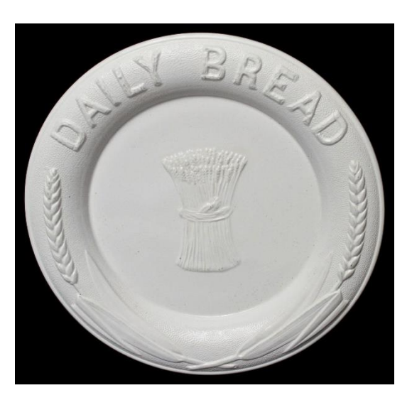
Sheaf of Wheat Daily Bread Plate