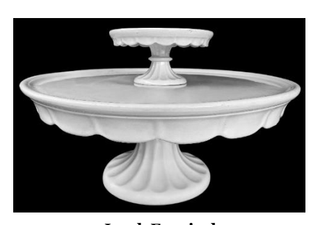
Jacob Furnival Giant Cake Stand, 18 5/8" Dia. Circa 1860s