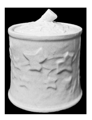
Ivy Sugar Bowl