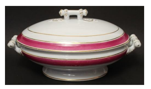
Cable & Ring Vegetable Tureen with Bands of Color