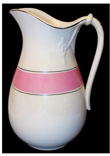
Cable & Ring Ewer with Band of Color