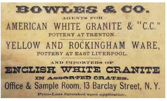
This circa 1880 advertisement by Bowles & Co. of Barclay Street in New York references "White Granite" and "C.C."