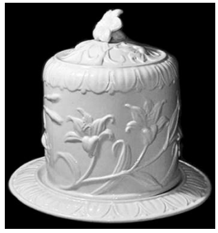
Cork, Edge & Malkin Lily Cheese Keep Circa 1860s