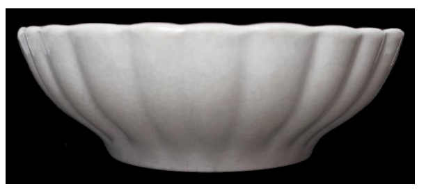
One Large and Two Little Ribs Salad Bowl