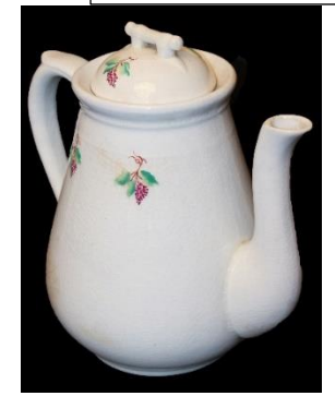
Grapes & Vines Teapot