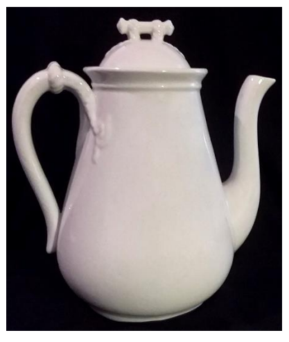
Cable & Ring Teapot