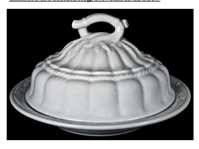
<u>Item 3: Paneled Hexagon Soup Tureen</u> <u>Clementson & Young, Reg. December 19, 1851</u>