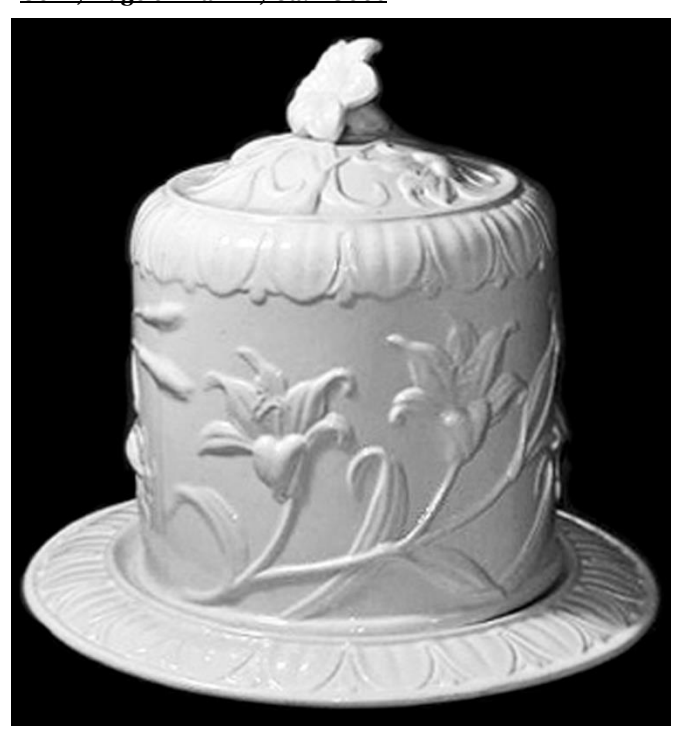
<u>Item 9: Lily Cheese Keep</u> <u>Cork, Edge & Malkin, Ca. 1860s</u>