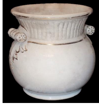
Lady Fingers with Acanthus Leaves Slop Jar