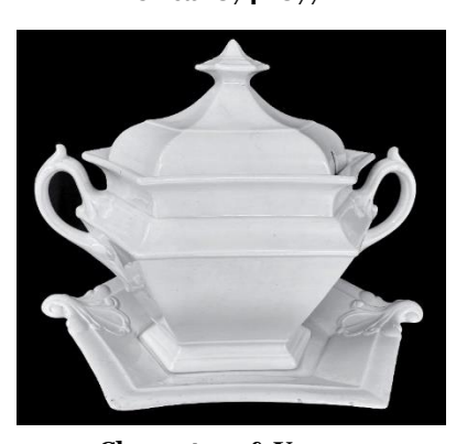
Clementson & Young Paneled Hexagon Soup Tureen Registered December 19, 1851