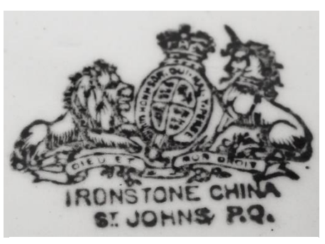
IRONSTONE CHINA ST. JOHNS, P.Q. (P.Q. for Province of Quebec) Mark 4