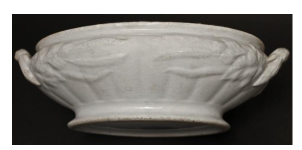
Wheat & Hops Vegetable Tureen Base