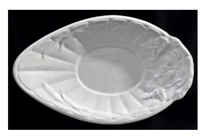
Wheat & Hops Relish Dish or Gravy Boat Underplate